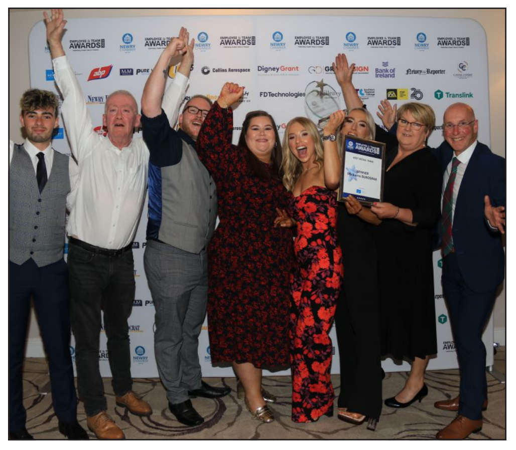
Mulkerns Eurospar Winners of the Best Retail Team award celebrate their success at Newry Chamber of Commerce & Trade Employee and Team Awards Ceremony.